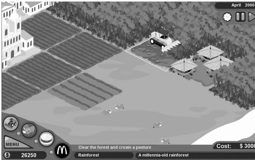
Figure 1.1 In Molleindustria's The McDonald's Game , players must use questionable business practices to increase profits.

grazing (see figure 1.1). These tactics correspond with the questionable business practices the developers want to critique. To enforce the corrupt nature of these tactics, public interest groups can censure or sue the player for violations. For example, bulldozing indigenous rainforest settlements yields complaints from antiglobalization groups. Overusing fields reduces their effectiveness as soil or pasture; creating dead earth also angers environmentalists. However, those groups can be managed through PR and lobbying in the corporate sector. Corrupting a climatologist may dig into profits, but it ensures fewer complaints in the future. Regular subornation of this kind is required to maintain allegiance. Likewise, in the slaughterhouse players can use growth hormones to fatten cows faster, and they can choose whether to kill diseased cows or let them go through the slaughter process. Removing cattle from the production process reduces material product, thereby reducing supply and thereby again reducing profit. Growth hormones offend health critics, but they also allow the rapid production necessary to meet demand in the restaurant sector. Feeding cattle animal by-products cheapens the fattening process, but is more likely to cause disease. Allowing diseased meat to be made into burgers may spawn complaints and fines from health officers, but those groups too can be bribed through lobbying. The restaurant sector