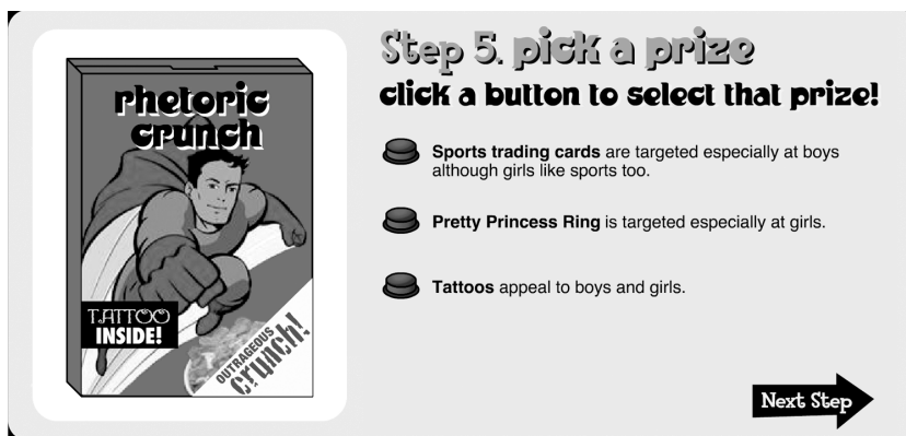
Figure 1.2 PBS’s Freaky Flakes offers a simple representation of practices of children’s advertising.

The argument Freaky Flakes mounts is more procedural than Retouch , but only incrementally so. The user recombines elements to configure a cereal box, but he chooses from a very small selection of individual configurations. Freaky Flakes is designed for younger users than Retouch , but the children who watch PBS Kids also likely play videogames much more complex than this simple program. Most importantly, Freaky Flakes fails to integrate the process of designing a cereal box with the supermarket where children might actually encounter it. The persuasion in Retouch reaches its apogee when the user sees the already attractive girl in the fake magazine ad turned into a spectacularly beautiful one. This gesture is a kind of visual enthymeme, in which the